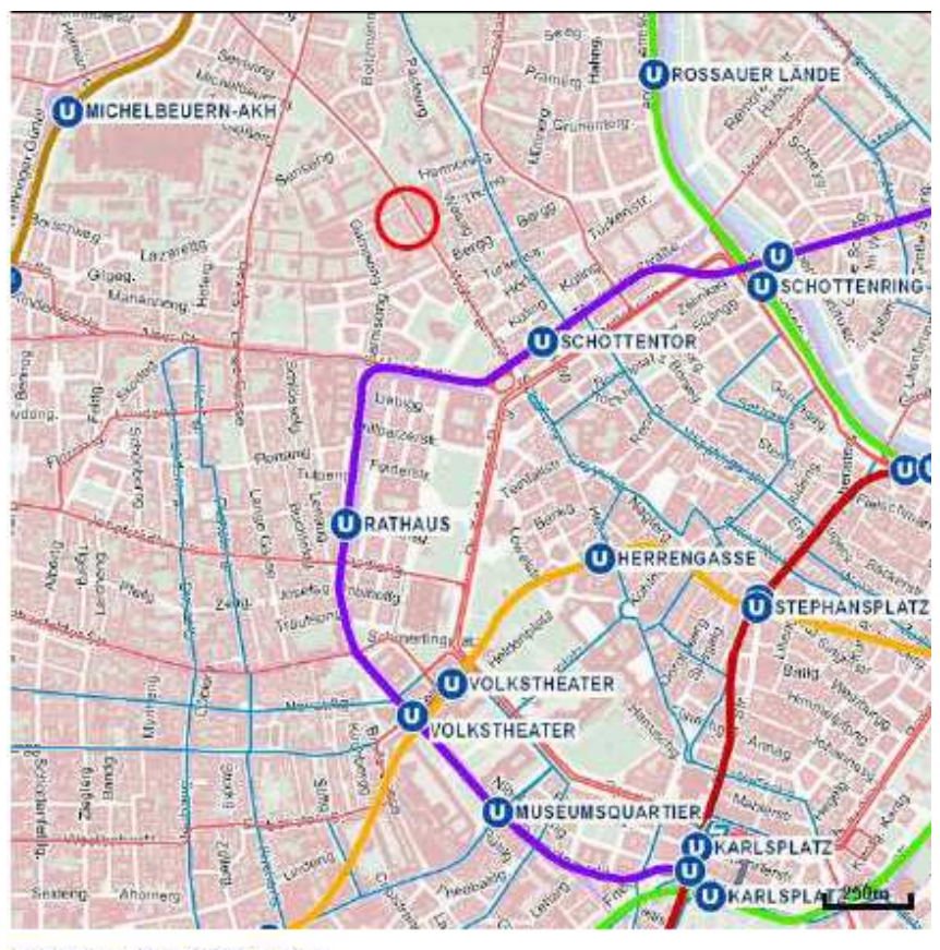
http://www.wien.gv.at/stadtplan/ Quelle: Stadt Wien – ViennaGIS <u>http://www.wien.gv.at/viennagis</u>

Workshop location Waehringer Strasse 17, 1090 Vienna, ca. 1.5 km from city center (Stephansplatz).