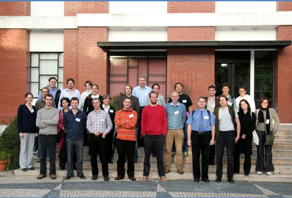
Lisbon, Portugal (January 2008)

many great meetings ! and just a few examples