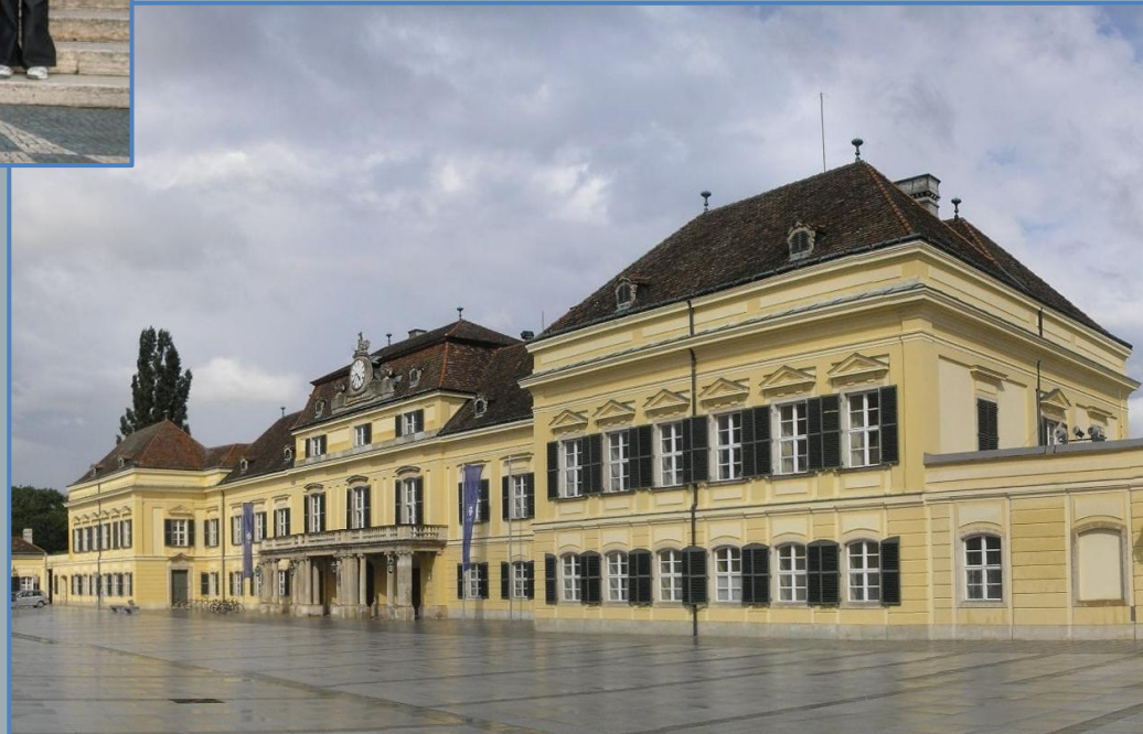
IIASA, Laxenburg, Austria (September 2009)

many great meetings ! and just a few examples