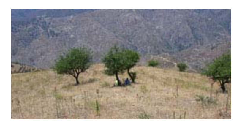
Fig. 4: Greek site at Monte Grappida, Bova Marina (650 m above sea level).

Foxhall's fieldwork based at Bova Marina, Calabria suggests that the Calabrian coast between ancient Rhegion (modern Reggio Calabria) and ancient Locri Epizephyrii was settled by Greeks as a landscape ( fig. 4 ). According to the literary sources, Rhegion and Locri were both founded in the seventh century BC, the former as a secondary foundation from Sicily, the latter by a mixed group of Greeks from several different cities. However, excavation and survey work suggest that the earliest remains in the countryside, 40 km from any ancient urban centre, are as early as the earliest material from the sites which later became cities. This leaves us with the question of whether the Greeks founded cities or settled a countryside. It is likely that the classical concept of an urban centre which informs most of our written sources was irrelevant to the Greeks who brought their culture and their writing to the western Mediterranean.