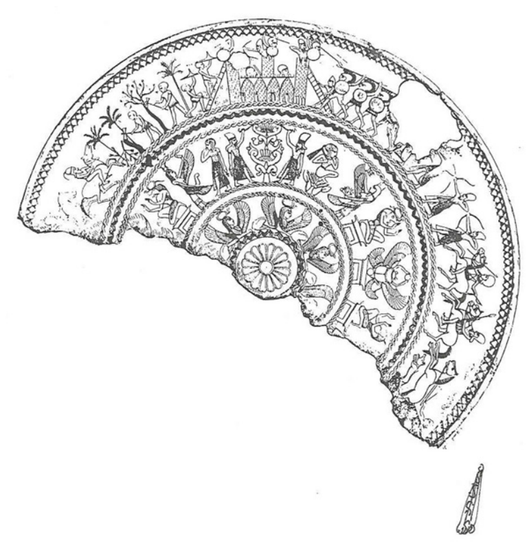
Fig. 5: Phoenician silver bowl from Amanthos, Cyprus, late eighth-early seventh century BC, showing Greek hoplites.

Samos and Gelon of Syracuse. The question of whether these groups of mercenaries were elites or non-elites was discussed, and the issue was raised of whether 'hoplites' in early Greece actually provided their own weapons and armour or whether it was provided by their patrons.