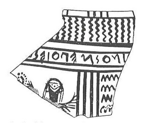
Fig. 6: Dipinto on local version of Late Geometric Euboean style sherd from Pithekoussai, Italy. Here the lettering forms one band of the banded decoration.

Lissarague explored the same phenomenon, the relationships of texts and writing on sixth century pottery. He noted considerable regional differentiation both in letter forms and in the way letters were used. Dipinti (including nonsense dipinti) were used for a wide range of decorative, visual and communicative effects including 'speaking' characters, labels and names, and enhancing visual themes (e.g. an aryballos portraying dancers with a long dipinto weaving in and out between the dancers evokes the movement of dancing).