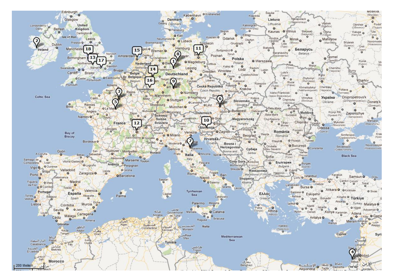
Figure 4: Countries of Origin (without participant from US). Map created with communitywalk.com.