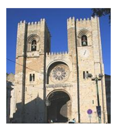
Lisbon Cathedral, built after 1147 over the remnants of the mosque of the Islamic period.