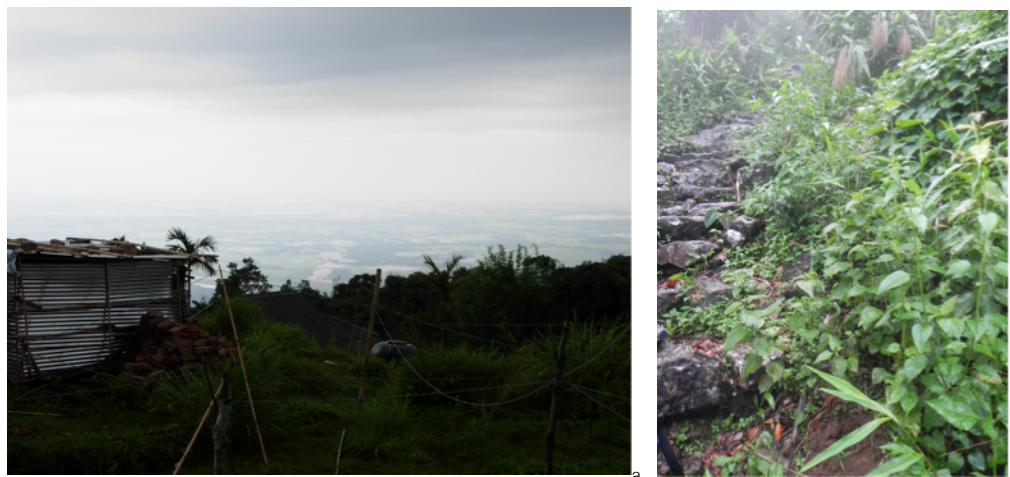
Fig. 2: View of the crest of Cherrapunji plateau down towards the lowlands of Bangladesh (a), typical sampling location of the surface soil samples along an altitudinal transect (b).

The samples are expected to show the present day precipitation signal, with differences in the hydrogen isotopic composition of its branched GDGT molecules due to the altitude effect. Because of a higher molecular weight, the heavy hydrogen isotope deuterium rains out faster than the normal hydrogen isotope, leading to an enrichment (positive \delta D -value) at lower altitude with the beginning of orographic rainfall. With the aim to test for the described effect, approximately 100g of material were collected at each of the sampling locations.