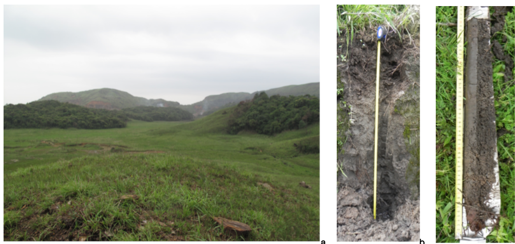
Fig. 3: The location of the Cherrapunji peat bog (a), peat bog profile of Cherrapunji (b), sampled along a slope and peat bog profile Nongkrem (c), sampled using a peat corer.