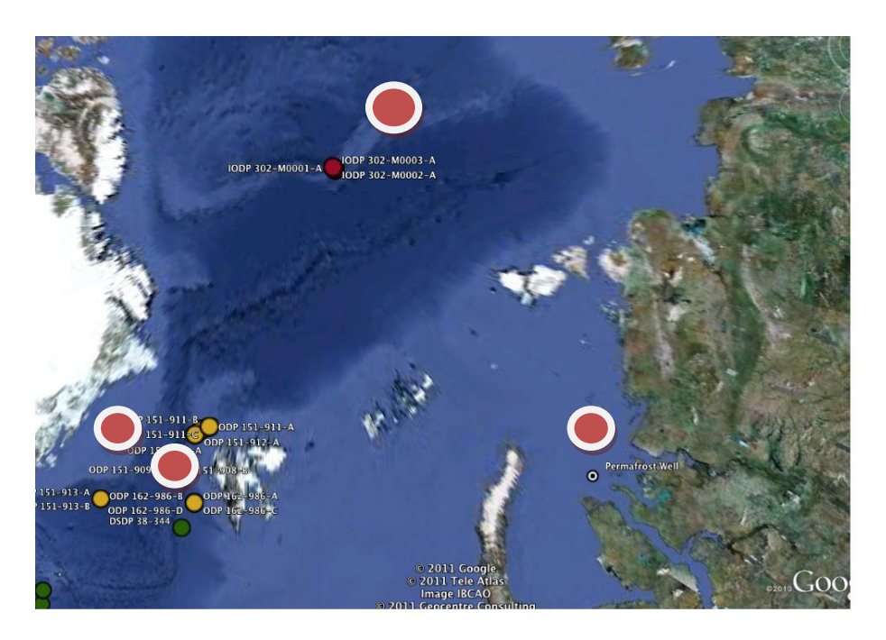
Figure 2 - Potential sites for Gas Hydrate investigation in the Eurasian Basin (red circles with white rim; East Greenland margin; Knipovich Ridge: Kara Sea; Lomonosov Ridge). Yellow and green dots are drilled and potential IODP sites.

Major scientific themes and hypotheses to be tested by drilling were thus identified by the breakout groups and was summarized by the following key themes: paleoceanography, tectonics and gas hydrates. The gas hydrate theme was developed into ideas of a new and Pan Arctic drilling proposal: "Arctic methane in ocean and climate systems."