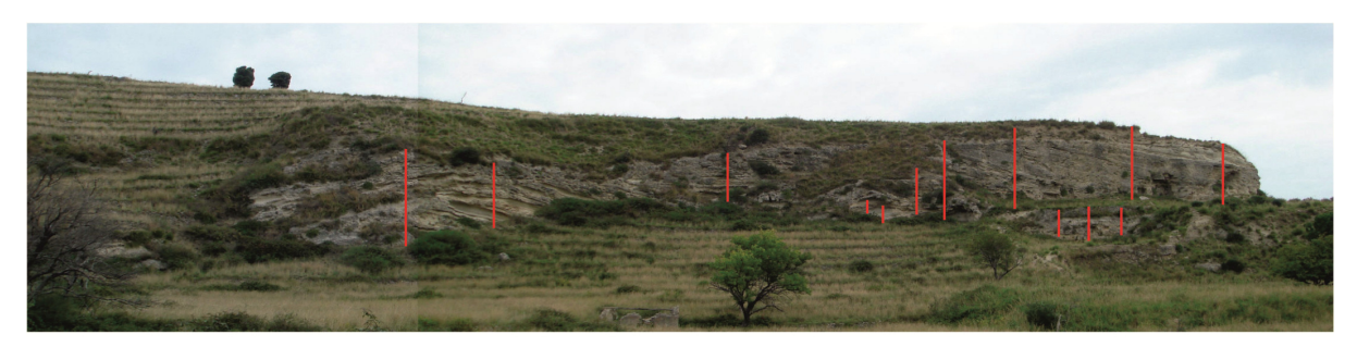
Fig. 1 – "La Montagna" outcrop, Messina, Sicily. The samples analysed in Bremen were collected along the logs indicated in red.

In Bremen I examined rock hand-samples, associated thin sections, and loose sediments collected from "La Montagna" (Sicily), a key site for the study of Pleistocene Mediterranean CWC deposits (Fig. 1).