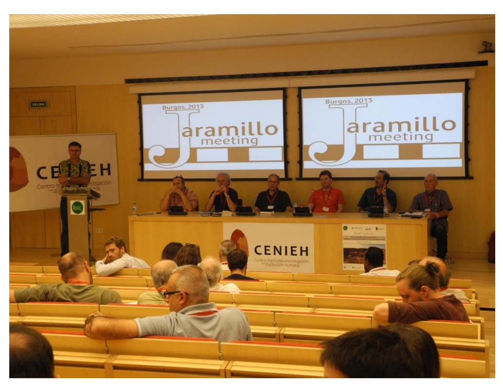
Figure 2: Final Round Table of the ESF EARTHTIME-EU meeting, the 27th September 2013.

The meeting ended on Friday morning with a Round Table including the keynote lecturers in order to encourage a final discussion on the main issues that have been raised during the meeting. A post meeting excursion to the Atapuerca archaeological sites, declared UNESCO World Heritage in 2000, was organised on Friday afternoon.