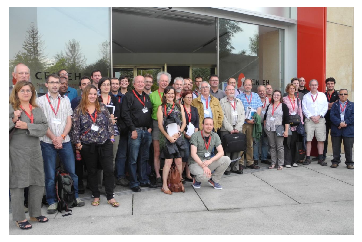
Figure 1: Participants and organisers of the ESF EARTHTIME-EU meeting from the 25th–27th September 2013 in Burgos, Spain, in front of the CENIEH, the 25th September 2013.

that regard, 5-10 min of questions were left after each key note lecture and ~5 min after each standard talk. In addition, two blocks of discussions (~30-40 min each) were scheduled at the end of the first session dedicated to magnetostratigraphy (day 1) and after the session on biochronology / biostratigraphy (day2). A final Round Table of 45 min involving the keynote lecturers was also organised at the end of the meeting.