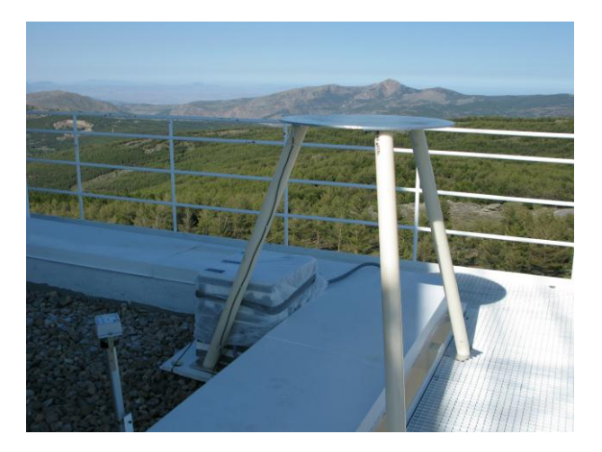
Figure 1 . The radio receiver deployed at the Astronmical Observatory of Calar Alto in the Sierra Nevada in southern Spain.

Objectives: The scientific discussions surrounding the experimental work tackled various aspects of TLE research where a combination of the radio recordings from the University of Bath with the optical recordings from the Instituto de Astrofisica de Andalucia might be particularly promising. It was found that an accurate modelling of the optical response of the mesosphere requires the inclusion of actual lightning parameters such as their rise time, peak current and continuing current which are normally not available from lightning detection networks. Another objective of future research is the occurrence of day time sprites for which there is compelling experimental evidence which could be complemented by theoretical modeling. Long delayed sprites were considered to be only a secondary science objective because the radio measurements would not be able to discriminate between proposed theories.