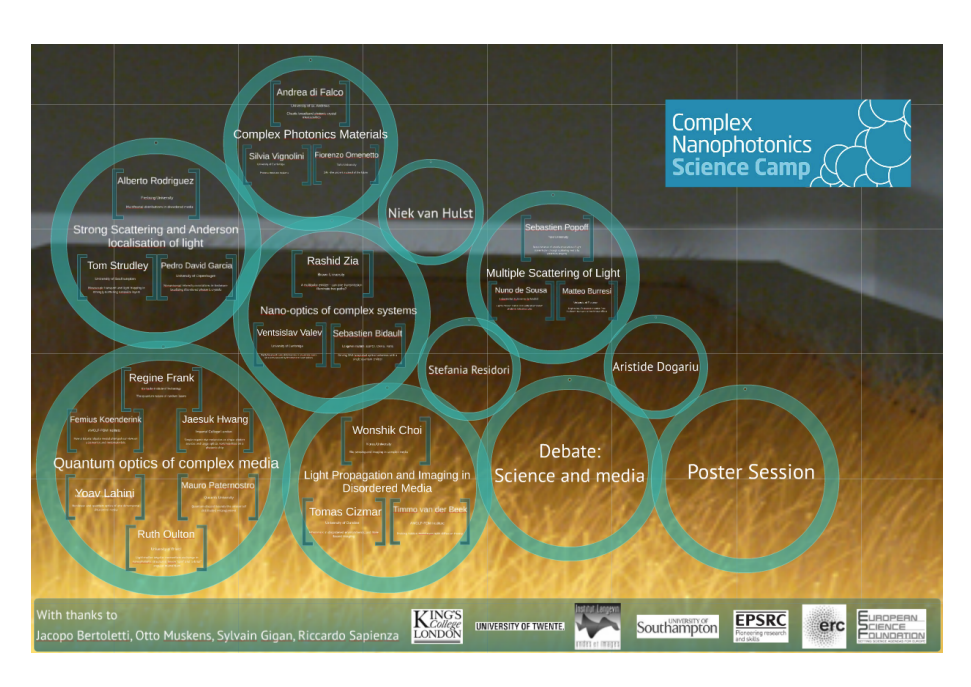
Figure 3. Preliminary Prezi presentation of the workshop

The Science Camp has brought together a generation of early career scientists in an informal and constructive atmosphere. The event has given people a sense of community around the theme of complex nanophotonics, a topic that was originally dispersed over different fields. At the workshop several emerging directions have been identified which will expand in coming years, such as in particular: wavefront shaping and imaging in complex biological media, quantum effects in nanophotonic systems, transport through complex environments and the persistence of coherent phenomena in noisy environments, and optical forces and nonlinearity.