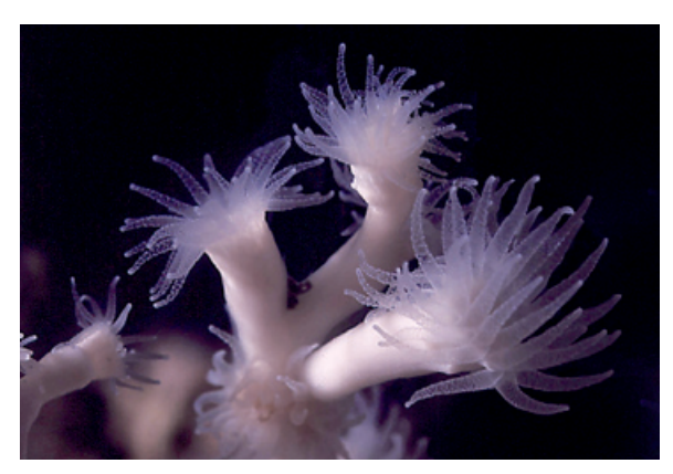
Lophelia pertusa – a cold-water reef-forming coral that lives in deeper water - is widespread across all oceans and, with other calcareous organisms, is threatened by ocean acidification.