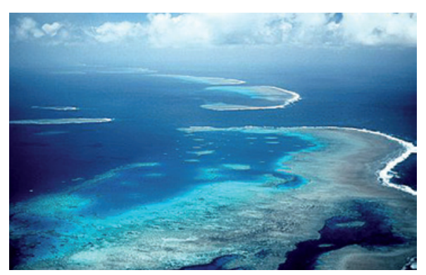
Aerial view of the Great Barrier Reef, one of the world's best protected and most fragile marine ecosystems.

Changes in the global biogeochemical cycles operate on different time scales. Uptake of CO2 and transport to the ocean interior is a rather rapid process (of the order of weeks to centuries). The effect of increased sedimentary carbonate dissolution (compensating ocean acidification) operates on intermediate timescales of the order of thousands of years. Ultimate recovery of the oceans from