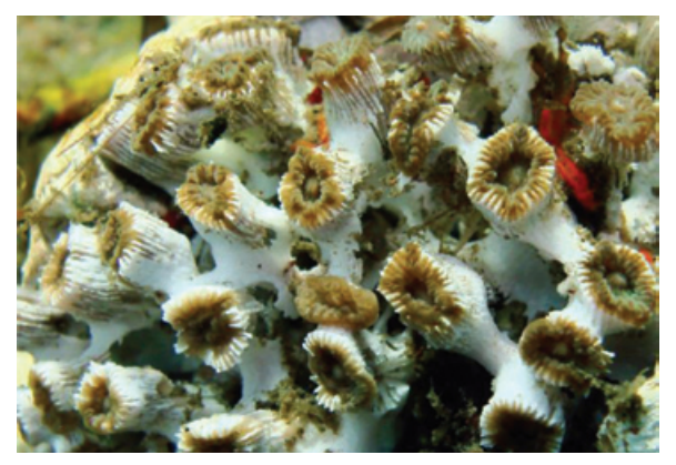
Endemic Mediterranean coral Cladocora caespitosa showing severe skeletal damage and dissolution due to ocean acidification.

of $90-600 billion/yr, given expected future carbon credit prices of $30-200/tCO<sub>2</sub>. It should be recognised that a large-scale decrease in carbon uptake by the oceans represents a large shock to current climate change mitigation efforts and would require a major upward revision of GHG reduction targets, activities and costs.