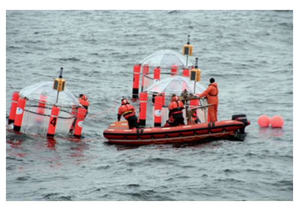
Study of ocean acidification in offshore mesocosm CO2 perturbation experiments.

The effect of ocean acidification on the global economy will depend on adaptations of the marine ecosystem as well as on human adaptation policies. Both are difficult to anticipate, making it difficult to calculate economic impact. A collaboration of natural and social sciences is required to research the potential for adaptation in both ecosystems and human systems, and the interplay between the two. The costs of adapting to ocean acidification need to be assessed.