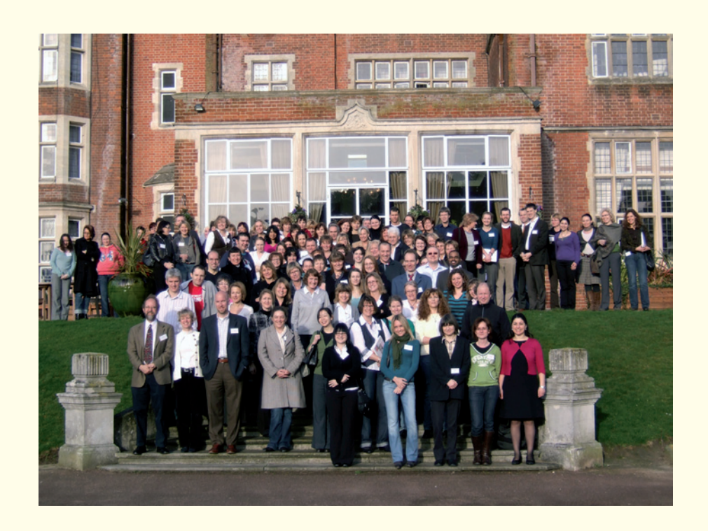
The junior investigators, study nurses, and data managers along with several (teaching) members of the EURAMOS Trial Management Committee taken at the third of the training courses 'Pan European Clinical Trials under current EU regulations'.

Scandinavian Sarcoma Group, Oslo University Hospital, Norway