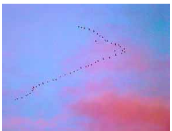
Geese over Speyside

scientists to attend this conference. The call for applications will be launched by end March with a deadline for applications on 3 May. Information will be available at www.esf.org/aqua2007.