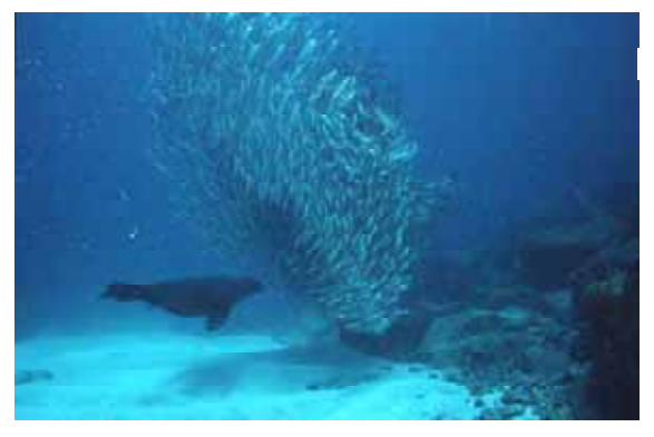
Large seal attacks small prey

Body size and species identity both contribute to the complex webs of interaction that determine the structure and function of ecosystems. SIZEMIC will attempt a synthesis of size and species-based approaches for describing structure and energy flux in ecosystems and seek to understand how the properties of individuals lead to observed patterns of size structure and diversity. This synthesis, building on recent theoretical developments in aquatic and terrestrial ecology, will be used to develop and test sizebased models that might be used to assess and monitor the impacts of human activities on ecosystems.