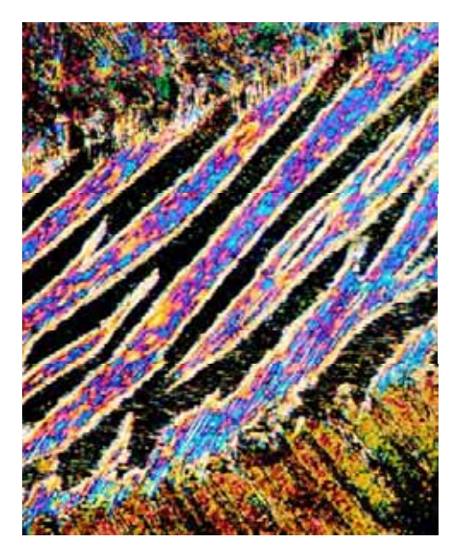
Crossed-lamellar structure of aragonite in a gastropod shell (polarized light) – Field view 50 \mu m