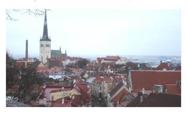
View across Tallinn

The LESC Standing Committee is one of the five disciplinary Committees composed of a Chair and leading scientists nominated by the ESF Member Organisations. Many of the 35 LESC Standing Committee members are distinguished professors in their own countries having close relations with the national research funding organisations. The ESF Standing Committees are responsible for