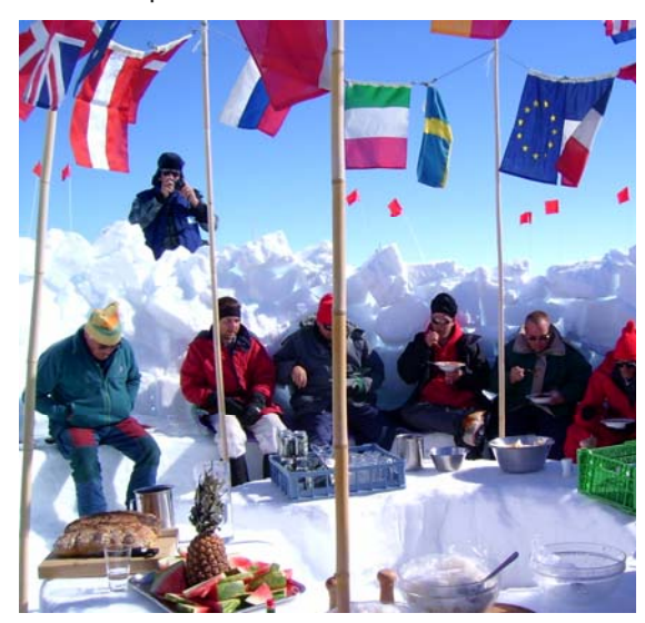
EuroCLIMATE: crossing borders