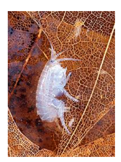
This 1/4-inch-long (0.5 mm) crustacean, Hyalella azteca, is common in aquatic systems and is used by scientists as an indicator of environmental health and water quality in streams, lakes, and other bodies of water.