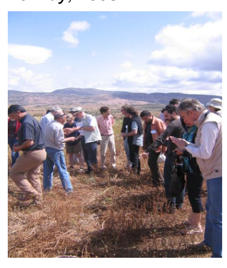
Delegates examine forage crops

Livestock and Global Climate Change Conference, Tunisia, 17-20 May, 2008