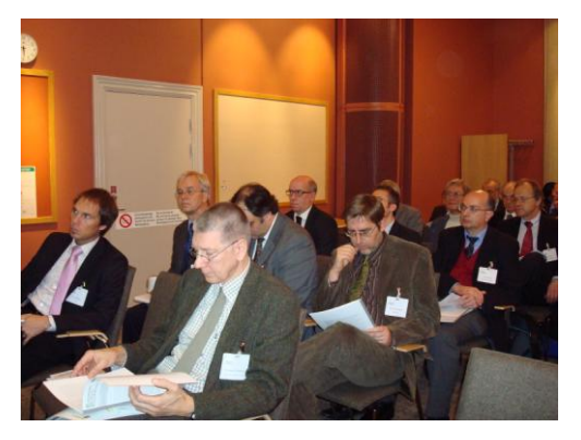
Participants at the ESF Science Policy Conference

The ESF Science Policy Briefing no 34 on Harnessing Solar Energy for the production of Clean Fuel was completed and launched during the ESF Science Policy Conference in Stockholm, Sweden, 26-27 November. It is the outcome of a thinking process among leading European scientists in the field of solar-to-fuel energy conversion. It presents a common scientific view on technologies to harness solar energy and how to meet the challenges for Europe today. The document recommends the prioritized development of novel biosynthetic solar-to-fuel and biomimetic photosynthetic technologies for a sustainable energy economy if Europe is to become the leader in the field.