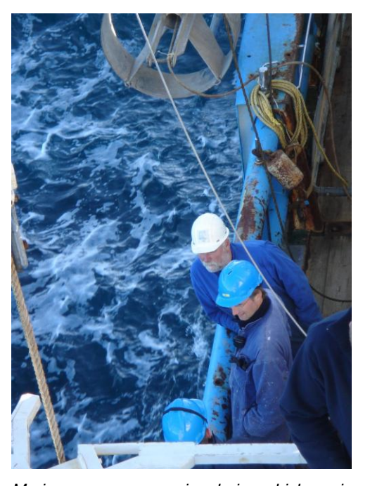
Marine core survey cruise during which marine sediments will be extracted for further analysis

The oceans are our climate regulators, cover the sites of fundamental geodynamic, geochemical and biological processes and have high-resolution records of the Earth's history in store for us. Scientific marine drilling and coring is crucial to cast light on both the deep and shallow (sub-) seafloors to advance our knowledge in the Earth and environmental sciences.