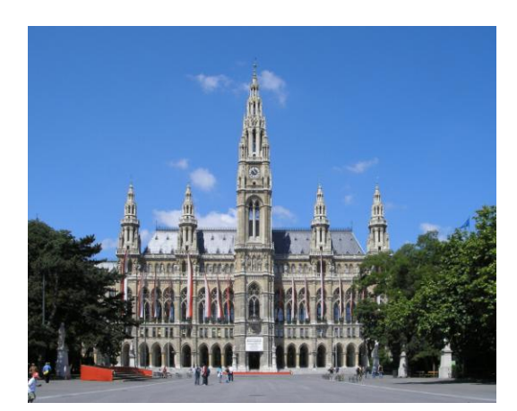
Vienna Town Hall.

Out of the total 38 EUROCORES Theme Proposals received by the ESF, 15 were in the LESC remit. The CG decided to recommend three of these, one of which is a joint proposal with the Standing Committee of Physical and Engineering Sciences (PESC). All three were considered to be excellent proposals, but the ESF Science Advisory Board recommended during its meeting on 26 September that only two of them be sent to the Member Organisations for their commitment due to the fact that one proposal, although excellent, overlaps too much with an existing programme funded by the European Commission.