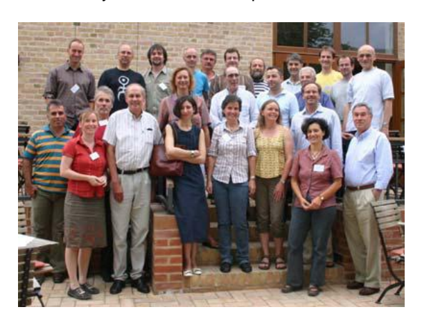
ESF-Workshop participants in Werder, Germany

The study of functional consequences of biodiversity change for ecosystem processes and services is a major research priority. However, so far these feed-back effects of biodiversity on ecosystem processes have only been studied in model experiments, not in real landscapes. At the landscape level, changes in land use have been identified as the major driver of biodiversity, but a comprehensive understanding of its effect on many functionally important taxa, on genetic diversity, on biological interactions among taxa, and on the relationship between diversity and ecosystem processes is still lacking. In order to guarantee comparable results that can be generalised across European landscapes, there is a need to unify the different research approaches to arrive at a common agenda for functional biodiversity research in Europe.