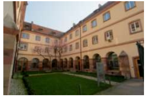
ESF headquarters, Strasbourg