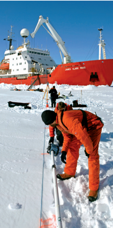
The RRS James Clark Ross during the JR240 ICEBell Cruise in the Bellingshaussen Sea RI Category: Research Vessels and Underwater Vehicles