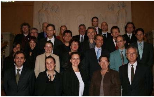
Participants to the Vienna conference