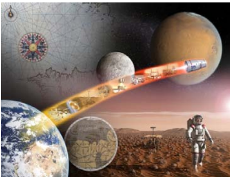
Aurora – en route to Mars and the Moon

Is it the pursuit of knowledge and science, wherever it leads us? Explorers throughout the ages have searched for fire, fresh water, food, milder weather, new hunting grounds, stones, minerals, spices, terra incognita, gold, precious stones, other life forms, rare animals, high mountains to climb, remote and/or mysterious places to reach and, in this process, bringing back answers, novel things to study, theories, and many more questions asked.