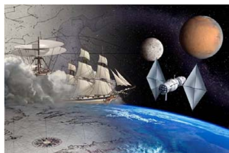
Human voyages – Earth, Moon, Mars

Adapting – Past encounters that took place on Earth show that human beings did eventually adapt to unforeseeable realities, although often at very large costs. While the first effects of an encounter between human and extraterrestrial life are unpredictable, humans need to be aware that they will be held morally, economically and politically accountable for their reaction and/or choice.