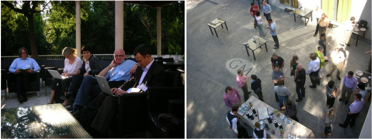
Figure 1. Afternoon meeting of session chairs (left) and coffee break (right)

Workshop attendance was by invitation only and a total of forty scientists (20 from US and 20 from Europe) were invited following suggestions by the four organizing ESF standing committees and the chairs. In addition, ESF science officers and NSF programme officers attended the workshop.