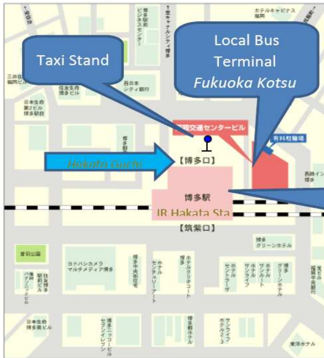
Local Bus Terminal Fukuoka Kotsu Center