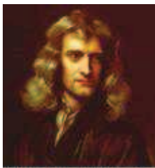
ISAAC NEWTON INSTITUTE FOR MATHEMATICAL SCIENCES