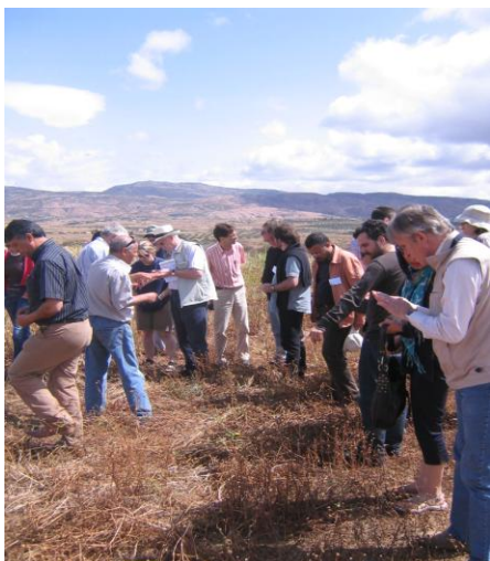
Delegates examine forage crops

This conference, which LESC sponsored through travel grants, attracted over 70 topical papers on animal science and climate change. More than 130 delegates from 36 countries attended. The breadth of the delegates' experience and background significantly contributed to the debate and discussions. It was very satisfying to see participants from developed and emerging countries realising that they were facing the same problems.