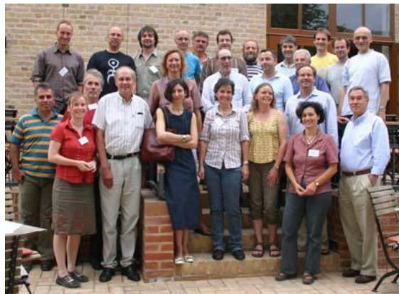
ESF-Workshop participants in Werder, Germany

The study of functional consequences of biodiversity change for ecosystem processes and services is a major research priority. However, so far these feed-back effects of biodiversity on ecosystem processes have only been studied in model experiments, not in real landscapes. At the landscape level, changes in land use have been identified as the major driver of biodiversity, but a comprehensive understanding of its effect on many functionally important taxa, on genetic diversity, on biological interactions among taxa, and on the relationship between diversity and ecosystem processes is still lacking. In order to guarantee comparable results that can be generalised across European landscapes, there is a need to unify the different research approaches to arrive at a common agenda for functional biodiversity research in Europe.