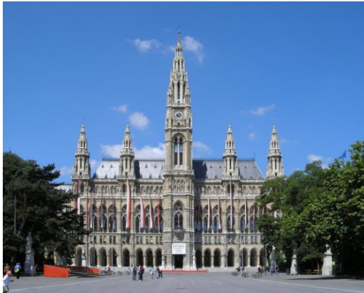
Vienna Town Hall.

Out of the total 38 EUROCORES Theme Proposals received by the ESF, 15 were in the LESC remit. The CG decided to recommend three of these, one of which is a joint proposal with the Standing Committee of Physical and Engineering Sciences (PESC). All three were considered to be excellent proposals, but the ESF Science Advisory Board recommended during its meeting on 26 September that only two of them be sent to the Member Organisations for their commitment due to the fact that one proposal, although excellent, overlaps too much with an existing programme funded by the European Commission.