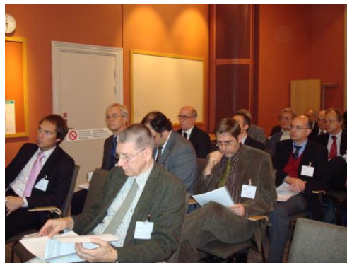
Participants at the ESF Science Policy Conference

The ESF Science Policy Briefing no 34 on Harnessing Solar Energy for the production of Clean Fuel was completed and launched during the ESF Science Policy Conference in Stockholm, Sweden, 26-27 November. It is the outcome of a thinking process among leading European scientists in the field of solar-to-fuel energy conversion. It presents a common scientific view on technologies to harness solar energy and how to meet the challenges for Europe today. The document recommends the prioritized development of novel biosynthetic solar-to-fuel and biomimetic photosynthetic technologies for a sustainable energy economy if Europe is to become the leader in the field.