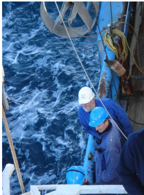
Marine core survey cruise during which marine sediments will be extracted for further analysis

The oceans are our climate regulators, cover the sites of fundamental geodynamic, geochemical and biological processes and have high-resolution records of the Earth's history in store for us. Scientific marine drilling and coring is crucial to cast light on both the deep and shallow (sub-) seafloors to advance our knowledge in the Earth and environmental sciences.