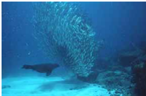
Large seal attacks small prey

Body size and species identity both contribute to the complex webs of interaction that determine the structure and function of ecosystems. SIZEMIC will attempt a synthesis of size and species-based approaches for describing structure and energy flux in ecosystems and seek to understand how the properties of individuals lead to observed patterns of size structure and diversity. This synthesis, building on recent theoretical developments in aquatic and terrestrial ecology, will be used to develop and test size-based models that might be used to assess and monitor the impacts of human activities on ecosystems.