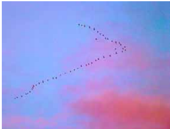
Geese over Speyside

scientists to attend this conference. The call for applications will be launched by end March with a deadline for applications on 3 May. Information will be available at www.esf.org/aqua2007 .