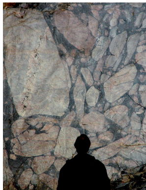
Impact breccia from the Vredefort dome