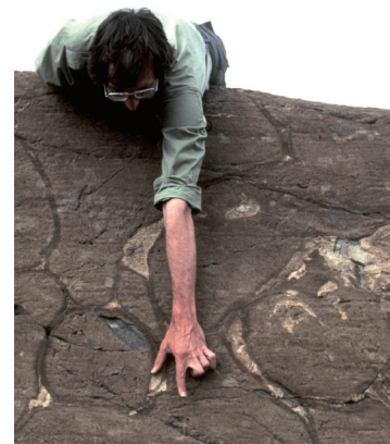
Archean pillow lava, Abitibi greenstone belt, Canada