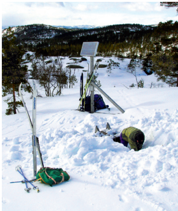
Manipulation of snow cover at Storgama in Norway.