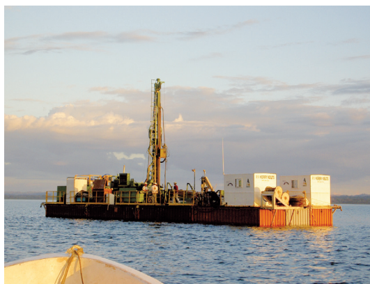
Drilling barge GLAD 800

The running period of the ESF MAGELLAN Research Networking Programme is for five years from February 2006 to February 2010.