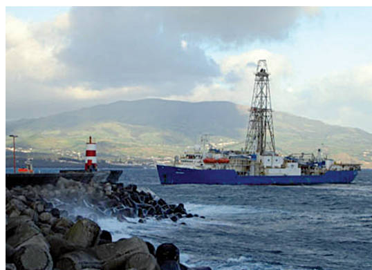
Drilling vessel R.V. JOIDES Resolution