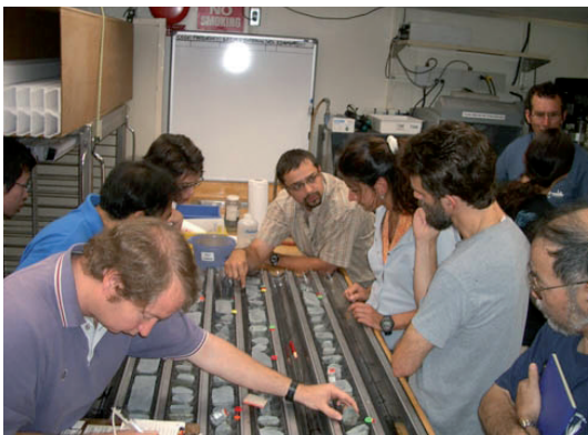
Shipboard sampling

Organisers are required, via an online procedure, to provide ESF with a financial and scientific report which will be the basis of the workshop output evaluation. The scientific report, which should be uploaded by the organiser in .pdf or .doc format, should not exceed six pages. The report should include: a summary (limited to one page), a description of the scientific content and discussion at the event (up to 4 pages), an assessment of results and impact of the event on the future direction of the scientific field (limited to two pages). In addition, the final programme of the meeting including the full list of speakers and participants must be provided.