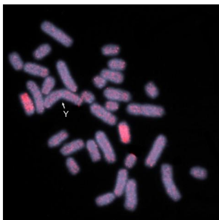
Fig.1 FISH with chicken Z probe on metaphase of Coleonyx elegans . Probe painted a pair of autosoms.

Using a probe from chicken ( Gallus gallus ) Z chromosome for hybridisation with metaphase chromosomes of several species representing several different lineages of squamate reptiles including studied geckos, we obtained information about synteny among bird and reptile sex chromosomes and autosomes. In C. elegans , the chicken Z probe painted a pair of middle-sized autosomes (Fig. 1). The same pattern was confirmed also in E. macularius as well as in C. variegatus . As also in other squamate reptiles probe from chicken Z painted autosomes and not sex chromosomes, we can say that sex chromosomes in reptiles are not homologous to those in birds. Moreover, this approach also allowed us to find syntenic regions of chromosomes among gecko species with different sex determining systems.