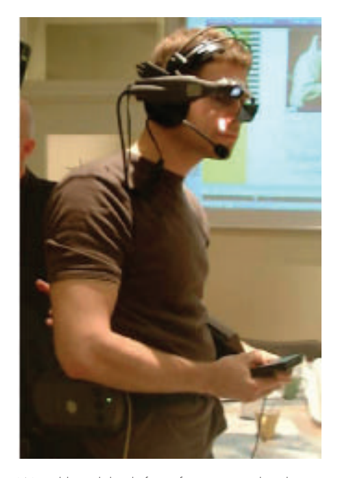
Wearable mobile platforms for augmented and virtual reality.

In a large-scale environment, relying on a central database server hardly makes any sense. The database might easily turn out to be a single point of failure and a bottleneck performance. One might