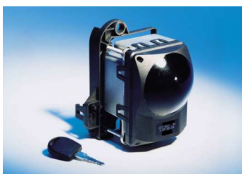
(a) Automotive radar @ 77GHz (from Robert Bosch GmbH)