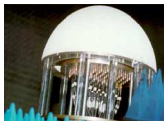
(b) Dome antenna for satellite communications (from Thales Alenia Space)