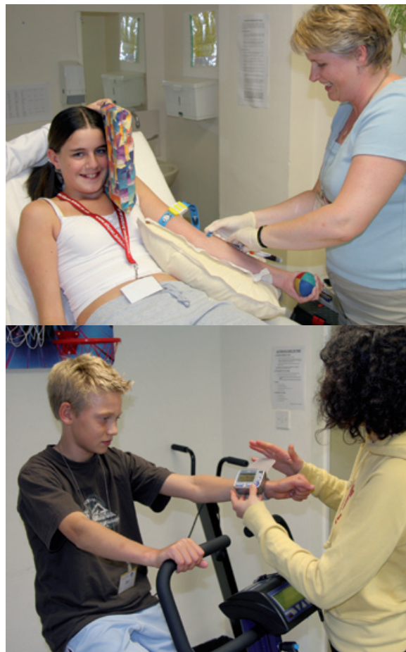
These 13-14-year-old members of the Avon Children of the 90s cohort study based in Bristol, UK, have gathered at the study's clinical centre for physical measurements which will provide data on fitness, growth and body fat, along with blood samples.

The European Child Cohort Network gathers cohorts of regional and national size with a population-based sample and an initial focus on children. The stress is on birth and child cohorts that study multiple aspects of the child's development, ranging from its psychological development and biological changes, to its social environment and environmental exposure, and this at several