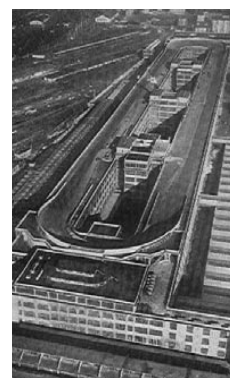
Futuristic industrial architecture...