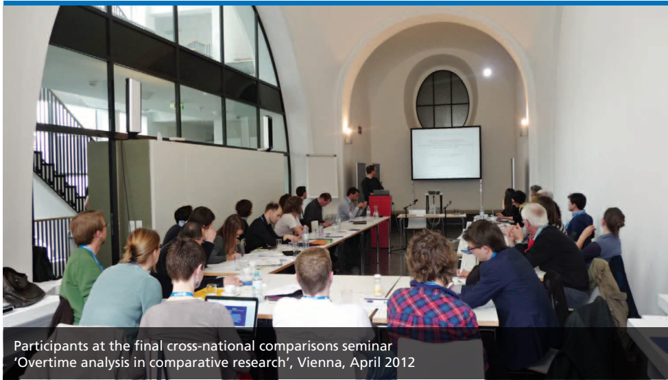
Participants at the final cross-national comparisons seminar 'Overtime analysis in comparative research', Vienna, April 2012

to the availability of proper statistical analysis tools but to the development of theoretical relevant macro measures and the link with the available micro data.