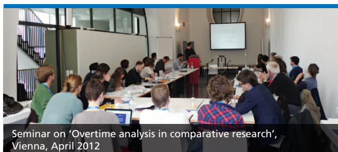
Seminar on 'Overtime analysis in comparative research', Vienna, April 2012

The seminar brought together methodological specialists in longitudinal comparative analysis with methodologically sophisticated substantive comparative researchers from sociology, political science, psychology, economics and demography. Major surveys like the European Social Survey are now available for repeated cross-sections and open up new opportunities to extend comparative analysis over time, both in terms of addressing substantive questions and in terms of the longitudinal validation of survey instruments, samples, and contextual measures. Further information is available here: