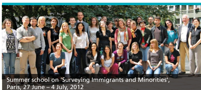
Summer school on 'Surveying Immigrants and Minorities', Paris, 27 June – 4 July, 2012

http://www.ccsr.ac.uk/qmss/seminars/2012-04-19/programme.shtml