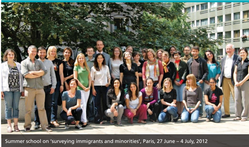
Summer school on 'surveying immigrants and minorities', Paris, 27 June – 4 July, 2012