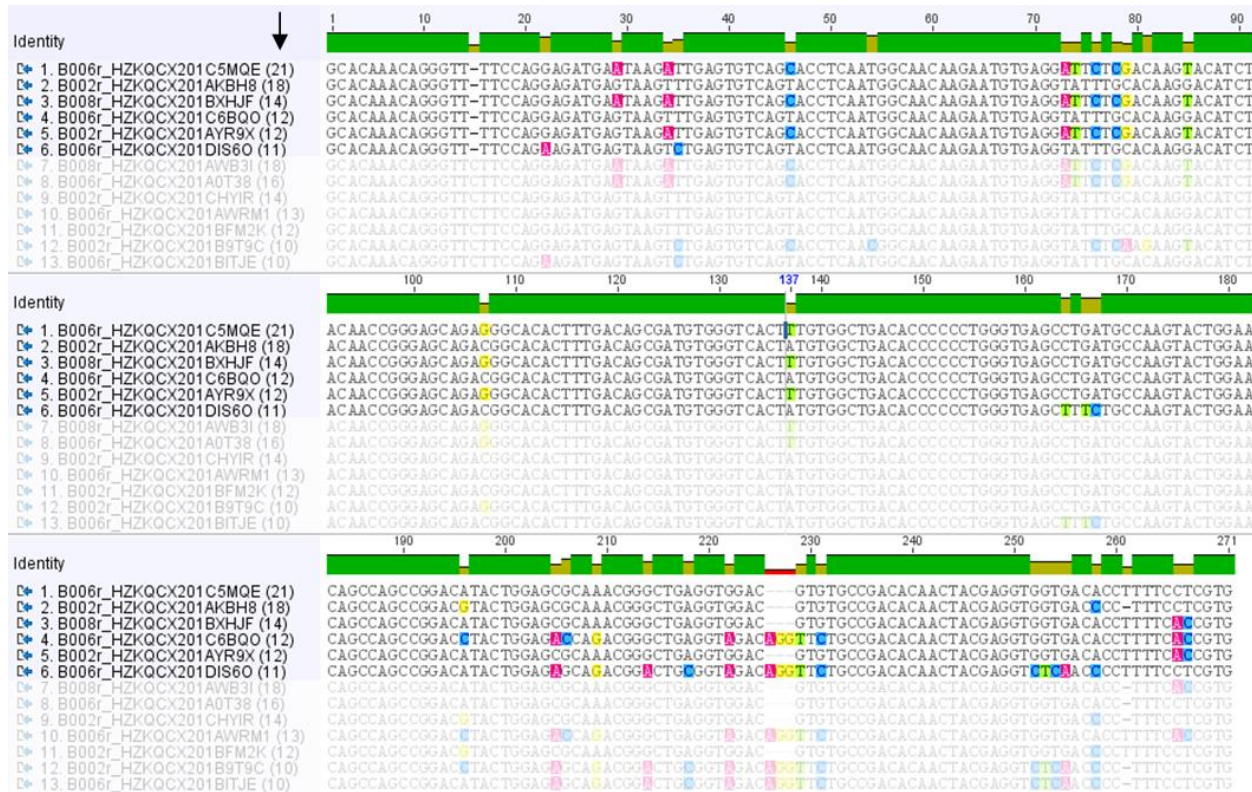
Figure 2: Data collected for vulture individual 19 in first GS Junior Titanium run indicating existence of multiple MHC class II B exon 2 loci in this species. Out of 476 total reads for this individual (filter settings different to Figure 1), sequences 1 to 6 represent sequences present in 10 or more reads (number of identical reads given in parentheses, see arrow), all 6 translating into a separate amino acid sequence. Sequences 7 to 13 (pale) are also present in 10 or more reads for this individual, however, translate into a premature stop codon. A presence of 6 or more alleles argues for at least 3, and possibly up to 6, MHC loci in A. monachus .