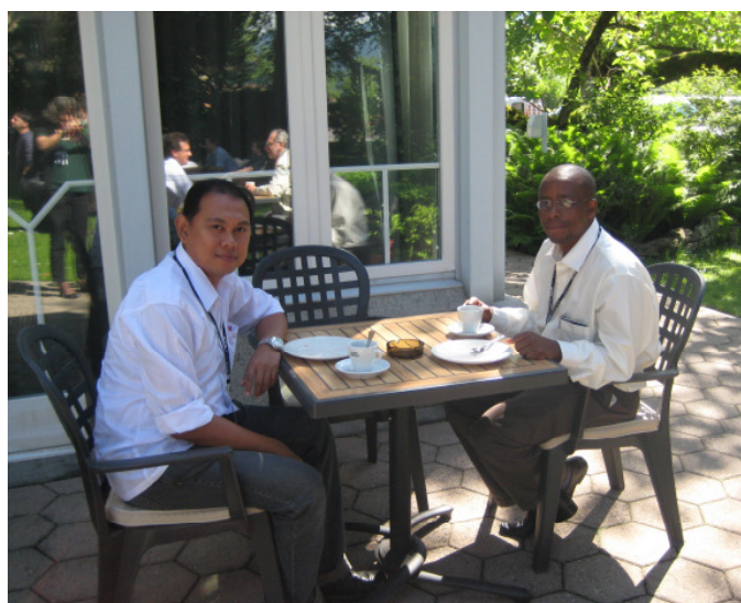
Young scientists from Indonesia (left) and from Kenya (right), supported by TTORCH, exchanging their experience of running measurement at sites contributing to the Global Atmosphere Watch programme of WMO. Both contributed with an oral presentation to the ACP-Symposium.