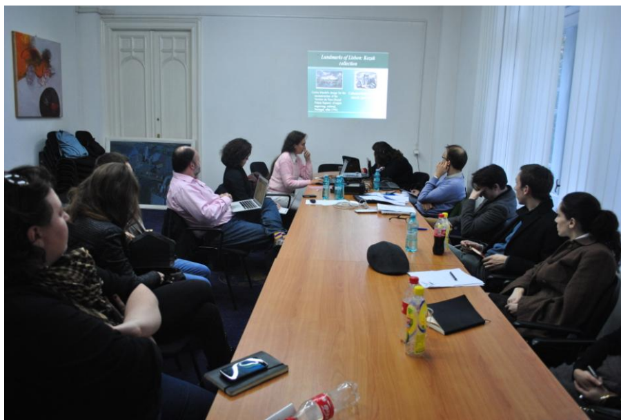
Public presentations round table (see attached programme for details)

The webpage (pointing to a google sites development)