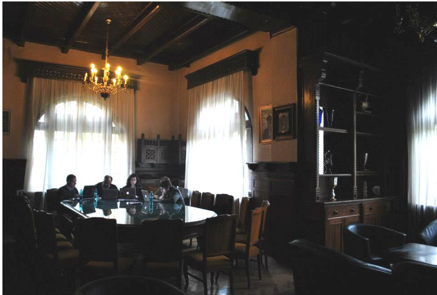
Foto: Discussions for the questionnaire

In the first two days concentrated work of the NeDiMAH WG leaders and members led to the development of a questionnaire.