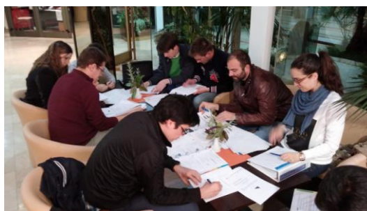
Fig. 4. Students solving the exam in groups.