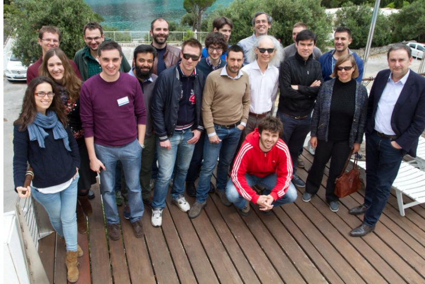
Fig. 1. Photo of the course (students and teachers)