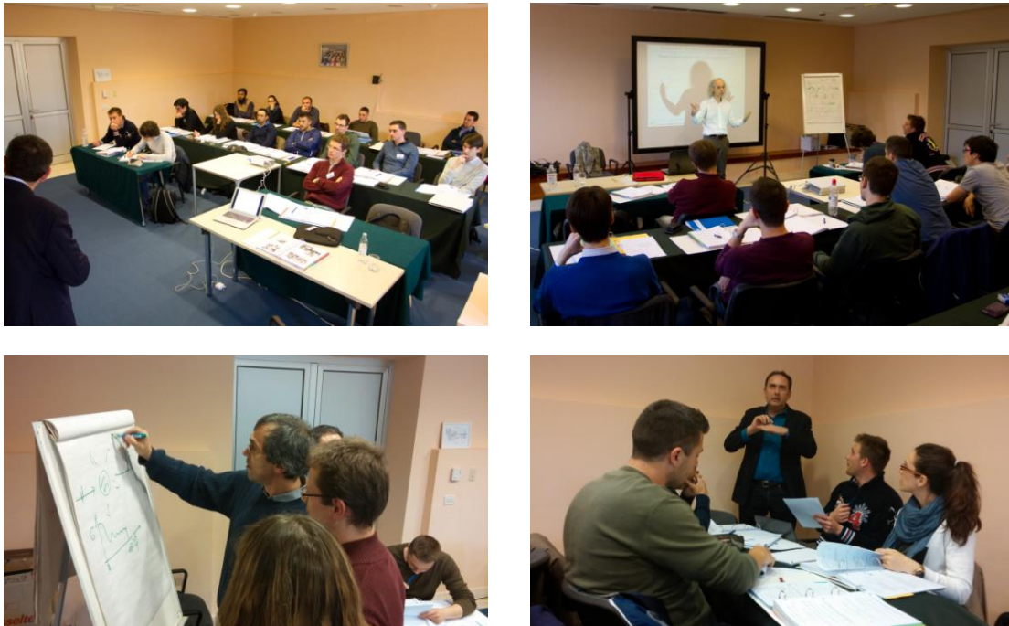
Fig. 2. Several photos taken during the lectures and during exercises.

All students were given the handouts of all the lectures at the beginning of the course on Monday. At the end of the course, all participants were also given CDs with all lectures in PDF format, as well as exercises and questions from the final exam. A selection of photos taken during the course by both students and organizers was also included.