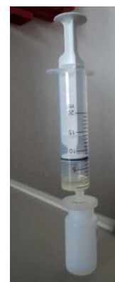
Fig.4: Collect supernatants Step V