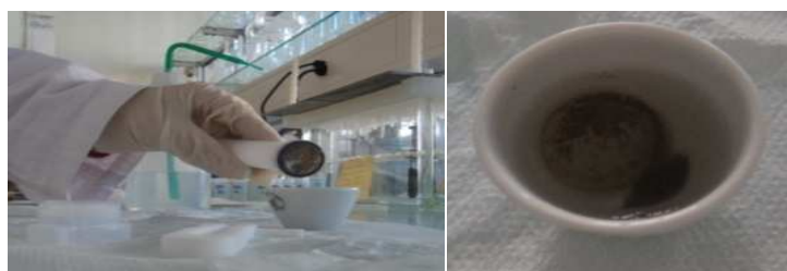
Fig. 3: Transfer samples residue to glass vials