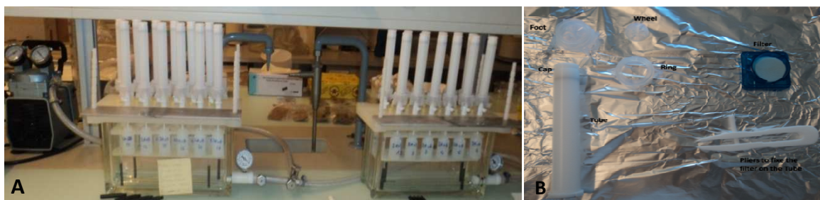
Fig. 2: A: Phosphorus line; B: Tube unites